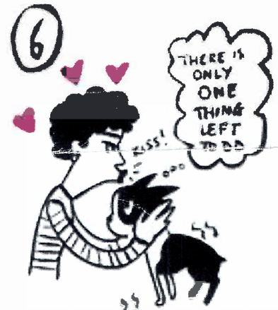
DON'T Grab his head and kiss it (This is an invasion of space)

Doing this to a dog who doesn't know you is like a perfect stranger giving you a great big hug and kiss in an elevator. Wouldn't that creep you out? And wouldn't you have the right to defend yourself?