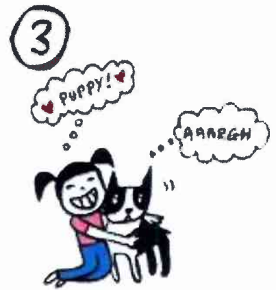
DON'T Grab or Hug him