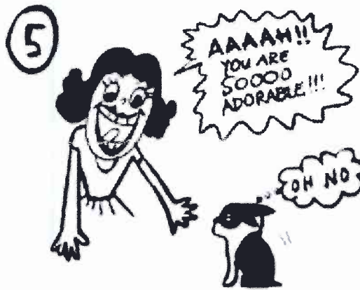
DON'T Squeal or shout in his face