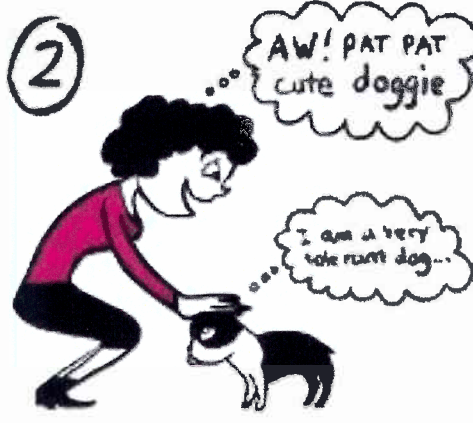
DON'T Lean over the dog & stick your hand on top of his head