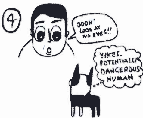
DON'T Stare him in the eye (This is an adversarial gesture)